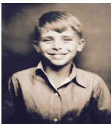
Who is This?

The New Spiritual Paradigm is a simple yet profound statement of who we are, our connection with the infinite and how these two realities and the force that holds them together interact. I AM, GOD IS, WE ARE ONE expresses this reality. When once embraced, this places the individual on a path of consciousness expansion and inner experience that reveals the deeper meaning of this declaration of life and existence.