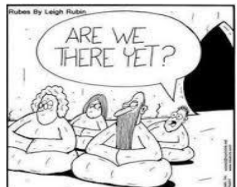
family trip to enlightenment